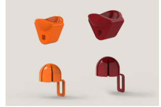
Juice extraction kits

A system developed by Zummo to assemble and disassemble the balls of the kit in just one movement.