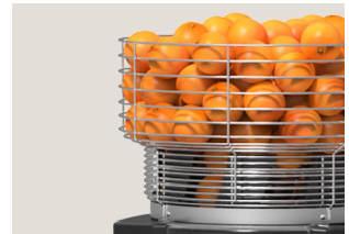
Basket in two sizes

The machine includes a 9 kg capacity basket with lid as standard, which prevents access to the oranges. In those cases when more autonomy is required, there is an optional basket with 16 kg fruit load capacity.