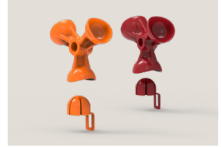
Juice extraction kit

The M kit, standard with the machine, can be complemented with the L kit (accessory) for larger citrus fruits. Squeezing kits count with the SimpleClick anchorage system, by which the balls are fixed with clip system, reducing the number of assembly parts, making it easier and faster.