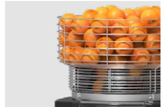
Basket in two sizes

The machine includes a 9-kilo capacity basket as standard equipment. In those cases when an increase in the juicer's autonomy is required, there is an optional basket with load capacity of up to 16 kilos of fruit.