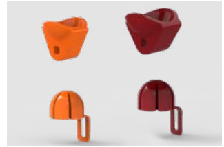
Juice extraction kits

A system developed by Zummo to assemble and disassemble the balls of the kit in just one movement.